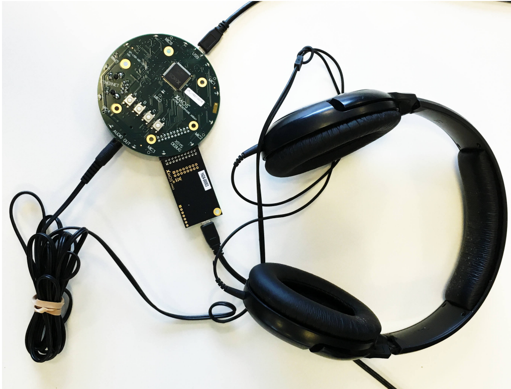
Figure 2: Hardware setup

To run the demo, connect a USB cable to power the Microphone Array Ref Design v1 and plug the xTAG to the board and connect the xTAG USB cable to your development machine. You will also need to connect headphones to the audio jack.