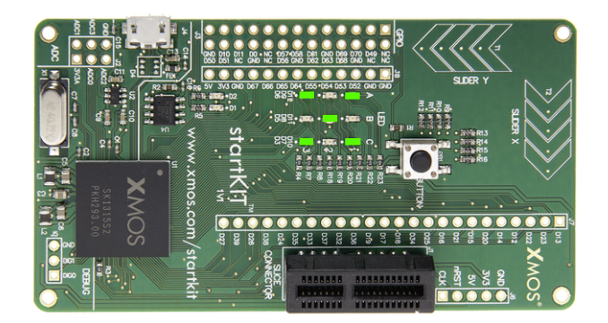
Figure 2: XMOS startKIT core module board button up boot

With the button on the xCORE startKIT in the up position when power is applied, the criss-cross LED pattern flashes on and off.