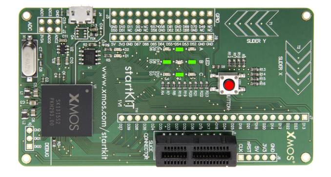
Figure 3: XMOS startKIT core module button down boot